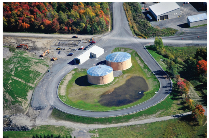
TOP: Construction of new scale foundations and the building addition at the DANC SWMF