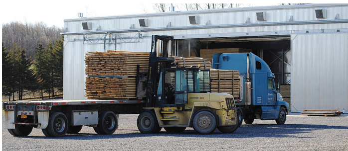
Johnson Brothers Lumber Kilns at Madison County ARE Park

Johnson Brothers is using the excess heat from the Gas-to-Energy plant at the main landfill to dry their lumber. They are the first company to take advantage of the excess heat produced by the Gas-to-Energy facility owned and operated by Waste Management Inc. The 5,400 square foot facility went online in March 2016 and is capable of holding up to 280,000 lbs. of green lumber worth an average of $75,000 in each of its five kilns. Lumber is purchased locally, within a 90 mile radius of the Cazenovia mill and sold throughout the United States and internationally.