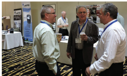
Exhibitors & attendees mingle & network