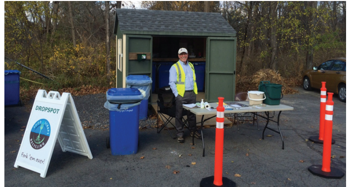
Tompkins County Solid Waste Division has opened a sixth Food Scraps Recycling Drop Spot in the Village of Cayuga Heights

The drop spot is located at the village offices and is open every Sun-