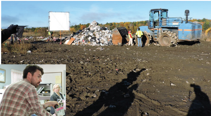
Movie Shoot at Fulton County Landfill