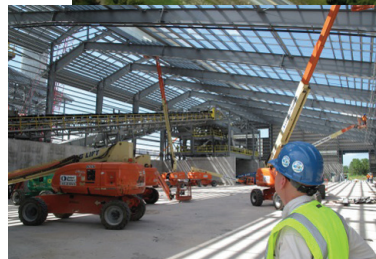
ABOVE & LEFT: Palm Beach County Fly Ash Processing Facility Construction