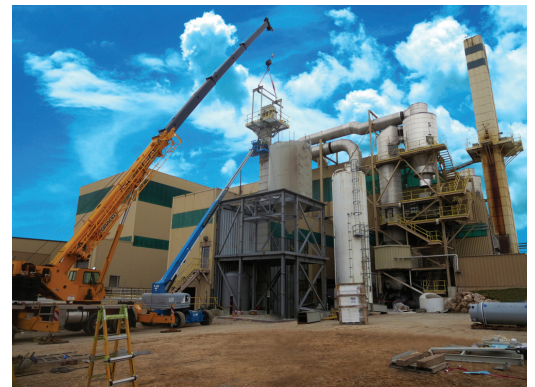
BELOW: WIWMD Fly Ash Conditioning Tower Under Construction