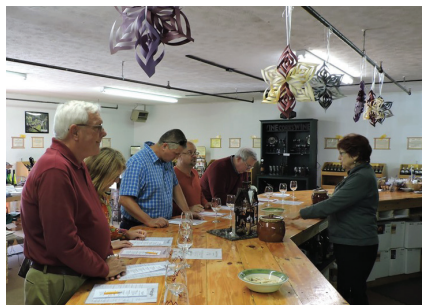
Swedish Hill Winery (pre-conference activity)