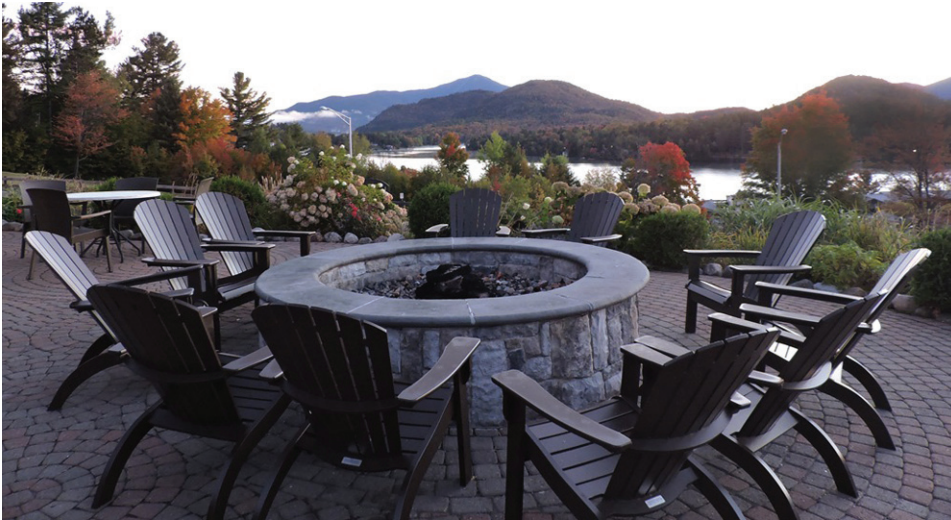
View from Crowne Plaza Resort, Lake Placid