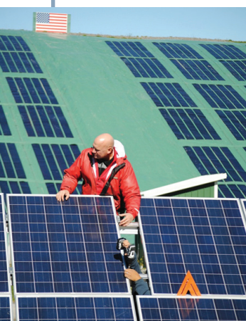
New solar panels were installed at the Madison County Landfill in front of the 40 kW photovoltaic membrane; both arrays provide significant cost savings for the Department of Solid Waste.