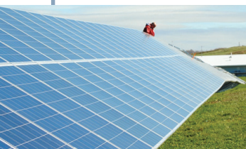
New 50 kW Solar Array, installed by Solar Liberty of Buffalo, New York, will power the Madison County Department of Solid Waste maintenance building.