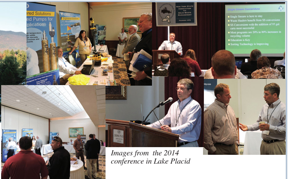
Images from the 2014 conference in Lake Placid