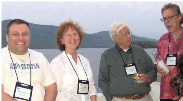
RIGHT & BELOW: Many enjoyed the cocktail reception, followed by Casino Night