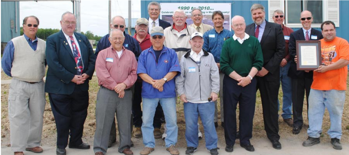
Madison County celebrated 20 years of recycling in conjunction with the Madison Cortland ARC in May.