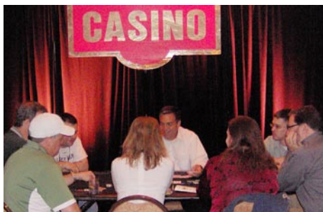
BELOW: Casino Night