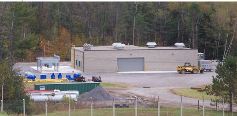
A portion of Fulton County's contribution for the Landfill Gas to Electric plant, located at the Department of Solid Waste, has been reimbursed through a grant, according to Department officials. Complete story on Page 6.

Individual awards can be made up to $5,000 with the maximum amount available at $20,000. The Scholarship was started to further the education of the next generation of solid waste managers who are studying in the fields of environmental science, planning, engineering or other suitable major related to the field of solid waste management at a New York State Public or Private College or University.